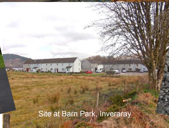
Site at Barn Park, Inveraray