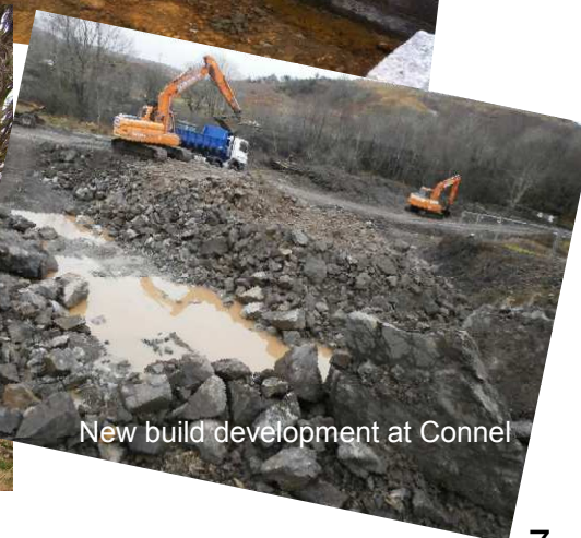
New build development at Connel