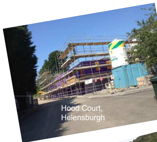
Hood Court, Helensburgh