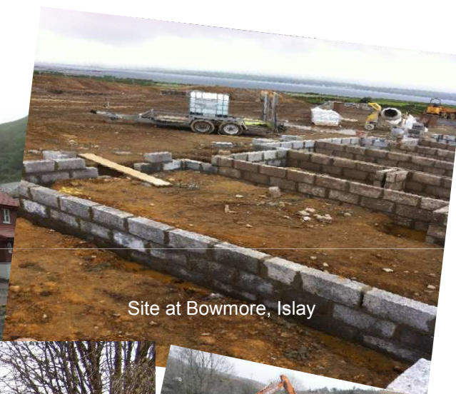
Site at Bowmore, Islay