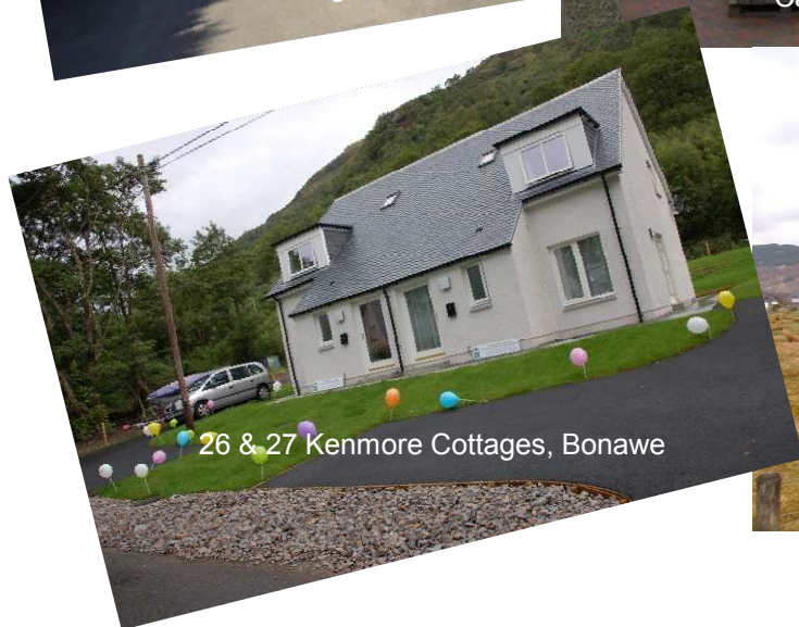
26 & 27 Kenmore Cottages, Bonawe