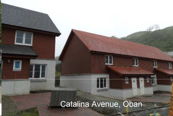
Catalina Avenue, Oban